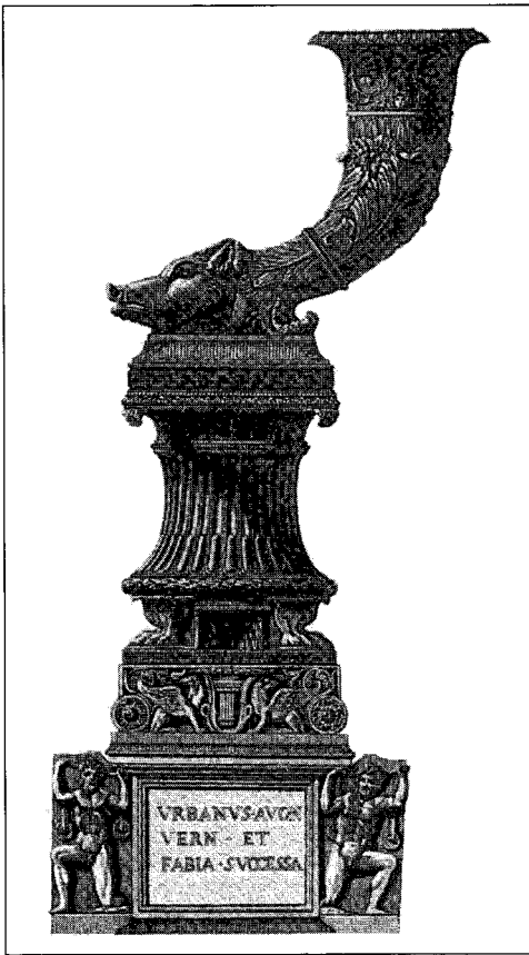
Fig. 2. A concoction of ancient – and new – fragments by Giovanni Piranesi (in his work Vasi, candelabri, cippi, sarcofagi, tripodi, lucerne ed ornamenti antichi, Rome 1778, Pl 91 ) bought by King Gustaf III as an authentic antique and now exhibited in the Medelhavsmuseet in Stockholm.