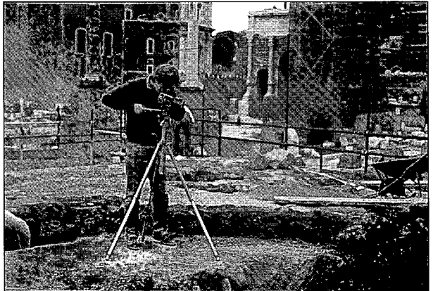
Fig. 7. Photographic documentation by a Swedish student during the Scandinavian excavation in the Forum Romanum in 1983.

A further problem is the growth of new evidence and the number of pages written about it. That this is one of the reasons for the longer study time is self-evident, when