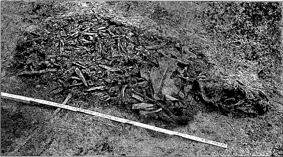
Fig. 3. The bear-grave from Sörviken, Stensele Parish, Lappland.

they belong to a later time period, after the reindeer-based economy had begun and up to modern time (Iregren 1985; Zachrisson 1985; Schanche 2000:271f).