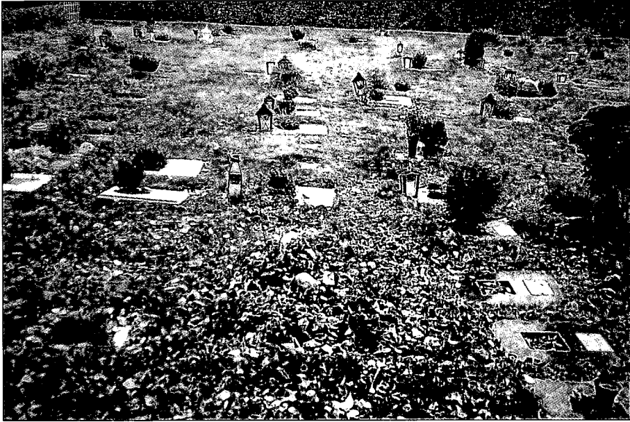
Fig. 4. The animal burial place at Pålsjö in Helsingborg. The picture was taken on All Saints' Day, and several graves are decorated with grave-lights.

breeding, animal experiments, or the transplanting of animal organs in humans. Thus there is reason to discuss the attitudes of people toward animals, and to examine the relation between people and animals in a longer time perspective.