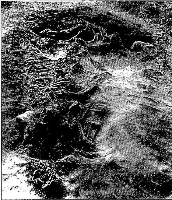
Fig. 2. The horse-grave from Ölands Skogsby, Torslunda Parish, Öland. A lower jaw is visible in the foreground.

discovered. The grave contained a man about fifty years in age, as well as a stallion that was three or four years old. The horse was placed next to the man's wooden chest, in a separate deposition. The horse lay on its side with its back toward the man's feet and its head in the south. Two ^{14}\text{C} dates from the horse's teeth gave a calibrated Isigma value of AD 670-780 (Holmquist-Olausson and Götherström 1998:107; Fennö Muyingo 2000:9).