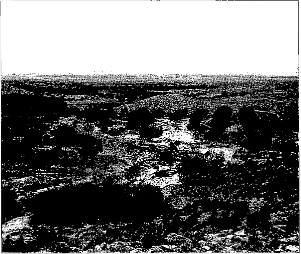
Fig. 2. Runoff agriculture. Olive orchards irrigated with rainwater that is naturally collected in the ravine (light grey in centre) and distributed by means of embankments and dug canals to the cultivation plots. Plain of Hichria, Sidi Bouzid, Tunisia, October 1989.

presented in the interpretations of the development of rural water management systems. In many of the studies, particularly those from the late 19 th century and early 20 th century, the waterworks are unanimously interpreted as the product of Roman colonisation, that is romanisation, of the North African interior. In more recent studies, mainly produced after political independence in Algeria, Morocco, Tunisia and Libya, alternative interpretations stressing the local, indigenous origin of the water structures have been advanced. There have also been attempts to accommodate the Roman and indigenous origins through models of interaction.