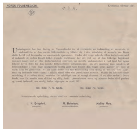
1. Introduction text with signatures at the top of the questionnaire’s first page.

During the zealous work in several cultural nations to collect the living traditions still among the people , it has been proven that the traditional art of medicine holds much useful information and is of great cultural-historical interest. Concurrently one has to be reminded that folklore quickly gets lost in our time among our younger generations, and we must save it from oblivion . (Emphasis added).