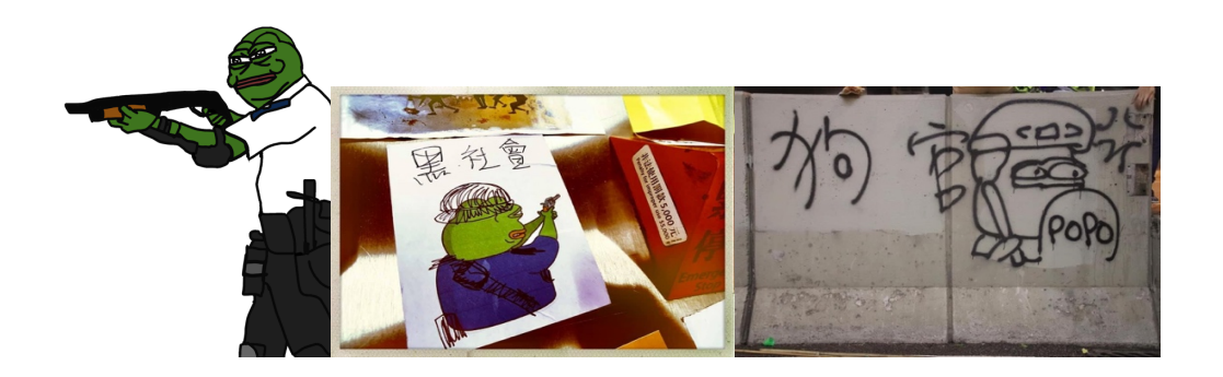
Figure 4. Examples of pepe the Frog as aggressor or officer the Hong Kong Police Force

Because Pepe remains on outsider, this is perhaps also the reason why the figure can sometimes be depicted as a villain-character. In several graphics in our collection (Fig.4) he is depicted as a Hong Kong police officer. Pepe remains an outsider who can morph into a cold-blooded aggressor, while the local animal figures are solely illustrated as oppressed Hong Kong protesters, never as "villains". The local mascots represent Hong Kongers while Pepe is strategically used to express gender fluidity, cultural exoticism or otherness.