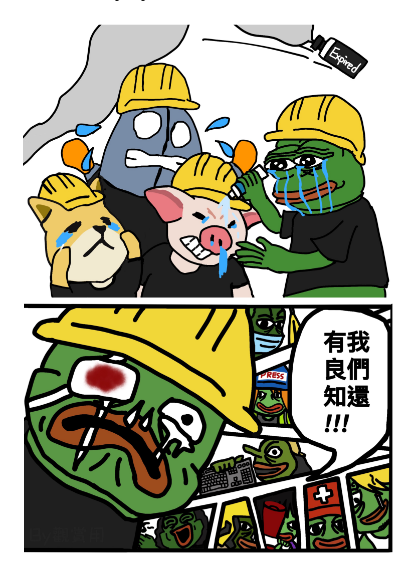
Figure 3. Pepe the Frog represented as a moderate subsidiary protester wo lei fei ("和理非").

fellow protesters, or friends and families), a hero and savior among all protesters who offers help to other local mascots (see Fig. 3). S/he is crying profusely while cleaning the eyes of Hong Kongers who have been hit with teargas. As in the "Eye For Hong Kong" meme, the crying-Pepe encapsulates the ability to display one's emotions while still protecting the vulnerable. One graphic is a derivative work from a famous animated movie scene, which depicts a heavily crying-Pepe as a supporter from abroad who aids the protest along with the local mascots. In another graphic Pepe is re-created into the CBS News Correspondent, Ramy Inocencio, a foreign journalist who received protective gear from the locals when covering the protests. Here again, Pepe represents an emotionally affected foreigner who offered a helping hand. Pepe is both localized and gender-fluid, both inside and outside the protest community, s/he is an "outsider-within" that people have faith in.