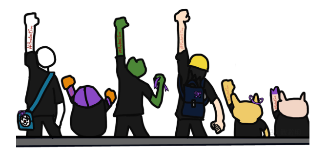
Figure 1. Digital drawing of LI-family and LI-dog with bowtie