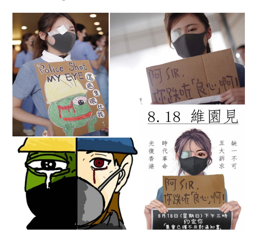
Figure 5. Pepe-Nurse images from our collection.

the nativist wing of the protesters. Choi, Lai and Pan have pointed out that both female and male anti-ELAB activists have tended to naturalize gender biases and justify gender hierarchies in work distribution based on one's biological sex, for example men would be better leaders while women would be the better at public relations. (Choi, Lai and Pan, 2021, 492)