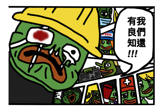
Figure 2. Pepe the Frog as Nurse K with bloody eye-patch.

We also noticed a greater fluidity of Pepe in the representation of protester role. Pepe is often illustrated as the bigger "hands and legs" ( \neq \not z meaning