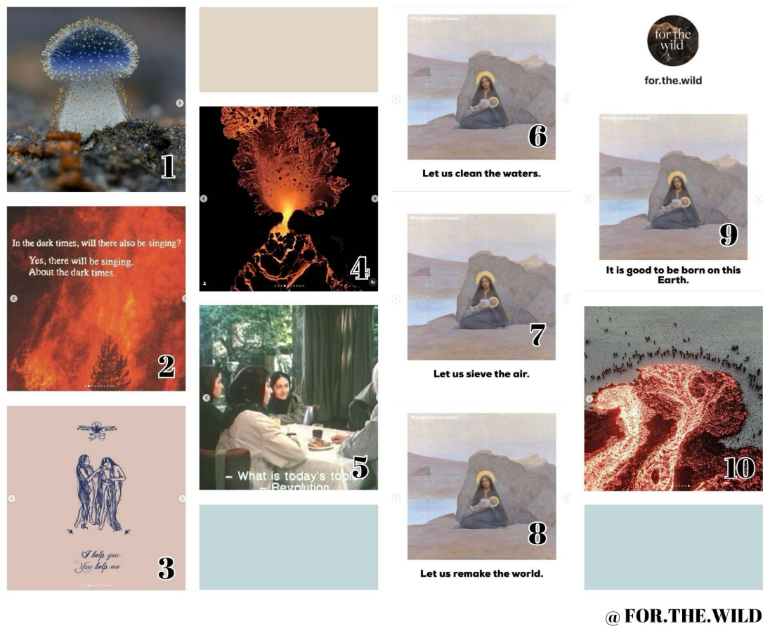
Figure 2. Carousel 2: @for.the.wild

believe, that this carousel comes on the anniversary of the January 6, 2021, riots on the United States Capitol, a day that violently marked what many had hoped would be the end of a destabilizing political era following Democrat Joe Biden’s win over Republican Donald Trump. Whether this was the intention of the account is not necessarily the point; rather, the cultural moment of upheaval and the subsequent collective release of breath matters for the tipping of emotions that had marked those four years and that we find echoes of in this carousel, even if for just us as viewers of it in its themes of grief, joy, and hope. With the rapid production of content in our mediated worlds, as within those seemingly endless chains of association the ideological threads of our cultural moment reveal themselves, it is crucial we spend time and space with the slow act of description and thematic analysis that speak to the emergence of such intertextual relations.