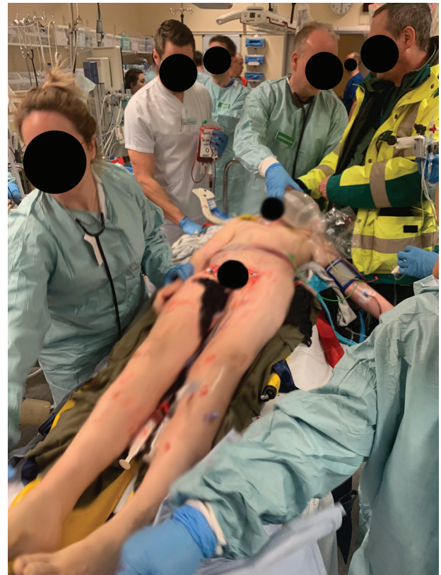
Figure 1 Patient on arrival to the emergency department. Bilateral vascular access and REBOA in situ (Zone I, deflated at this point).

The patient received an 8 Fr sheath in both the right common femoral artery (CFA) and left common femoral vein using ultrasound guidance. REBOA (ER-REBOA) was inserted and placed uninflated in Zone 1 using landmark guidance while he was being rapidly transported to the operating theater. Total ED time was around 12 minutes. A damage control laparotomy was performed on arrival to the operation room. During laparotomy, the balloon was inflated for 5–7 minutes with 4 ml of saline as invasive systolic blood pressure (SBP) was measured at 40 mmHg; it was then used as a bridge to massive transfusion and definitive treatment with a return of spontaneous circulation. As the patient's only other access was intraosseous, the femoral venous access was used for massive transfusion since further peripheral vascular access could not be established due to his hypovolemic state. The balloon was gradually deflated while massive transfusion with 4 units of PRBC, 3 units of FFP and 1 unit of platelets was given as well as fibrinogen and tranexamic acid. The SBP was stabilized at 110 mmHg. The injuries consisted of laceration of the abdominal wall and major parts of the intestinal mesentery causing massive hemorrhage from the ileocolic artery and branches, which were ligated. A small retroperitoneal hematoma was also detected. Due to extensive devascularization of the distal parts of the small bowel, 2 meters of the small bowel, including the cecum, was resected