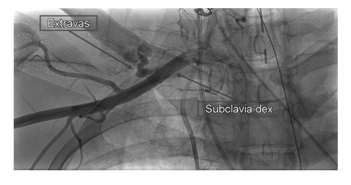
Figure 1 Angiography showing extravasation from the right subclavian artery after CVC placement.