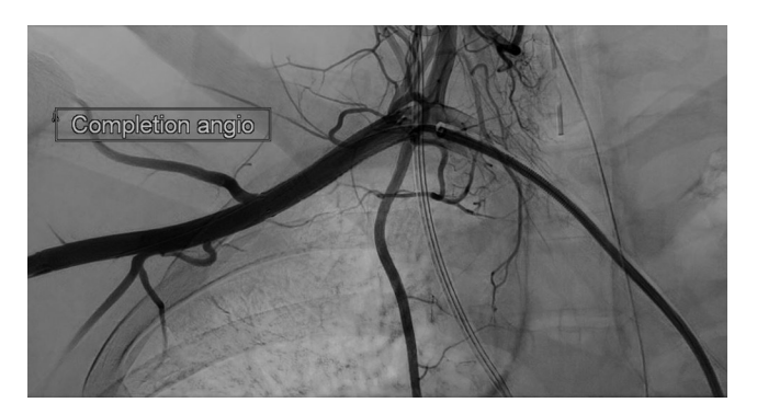
Figure 4 Completion angiography after placement of a correctly sized stent graft in the right subclavian artery showing no extravasation.

Misplacement or injury to the subclavian artery during CVC placement is reported in the literature and is almost always right-sided, thought to be because of the specific anatomy [5]. Most are detected immediately because of the bright red, pulsatile backflow from the puncture needle or cannula [6]. If not, it may be hard to identify as a hematoma since extravasation from the subclavian artery is generally only visible at a late stage and the outcome