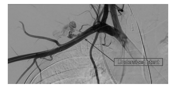
Figure 2 Undersized stent graft with continued extravasation from the right subclavian artery.

stent graft (W.L. Gore & Associates, Flagstaff, Arizona) was placed in the right subclavian artery, distally to the right vertebral artery, covering the vessel injury. The stent graft was, however, undersized resulting in continued extravasation (Figure 2). Additionally, the undersized stent graft migrated distally in the subclavian artery and after unsuccessful attempts were made to reposition the migrated stent graft the decision was made to puncture the right common femoral artery and a 6 Fr introducer was placed retrograde (Figure 3). An 8 \times 50 \text{ mm}^2 Viabahn stent graft was successfully positioned in the right subclavian artery, distally to the right vertebral artery, covering the vessel injury and discontinuing the extravasation (Figure 4). After the procedure, both radial and ulnar pulsations could be heard using doppler.