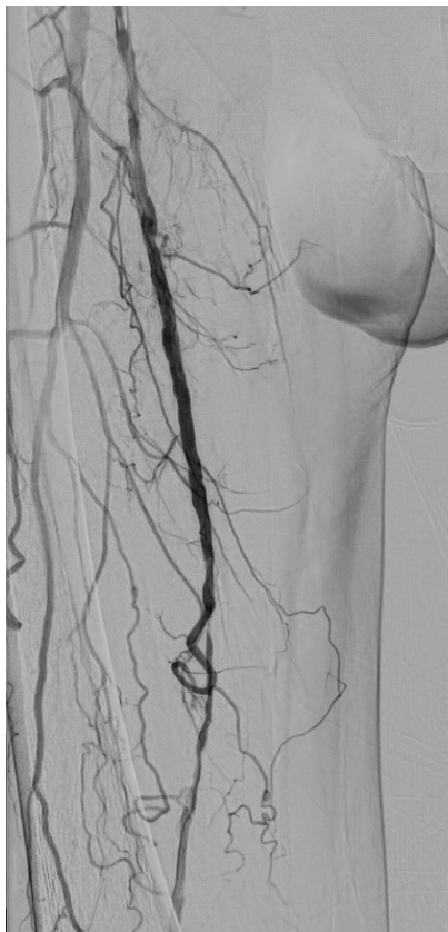
Figure 5 Final angiography after extraction of the foreign body.