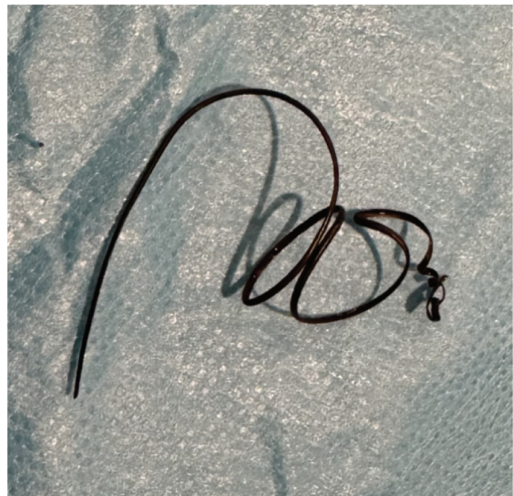
Figure 6 The extracted foreign body.