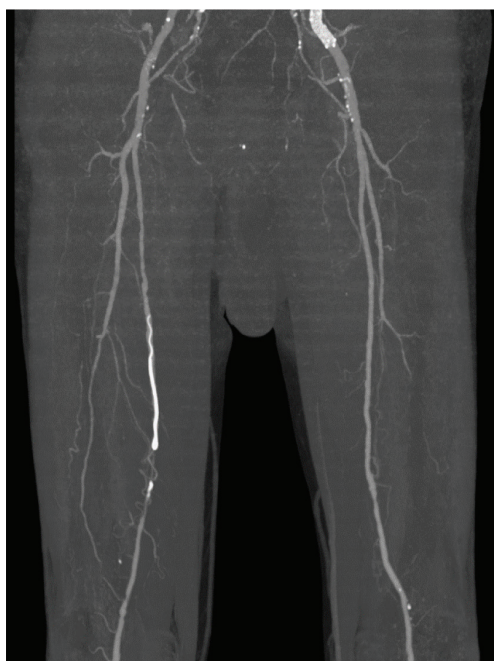
Figure 1 CTA showing the foreign body in the midsection of the SFA.

tomography angiography (CTA). CTA revealed a foreign body resembling the remnant of a guide wire in the mid-section of the SFA (Figure 1). To retrieve the foreign body we used an endovascular approach with a snare (AndraTec Exeter Snare ES-25) to catch the foreign body, which was then easily extracted through the 6 French introducer used for access via an antegrade puncture in the patient's right femoral artery (Figures 2–6).