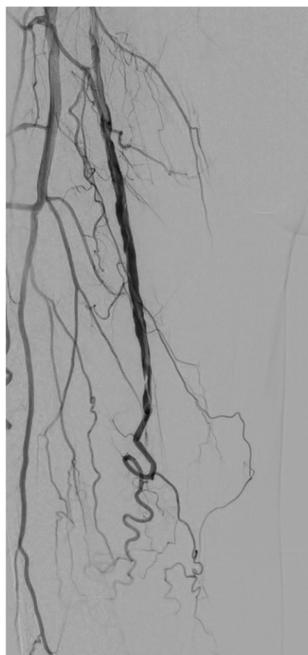
Figure 2 Angiography of the SFA with the foreign body.