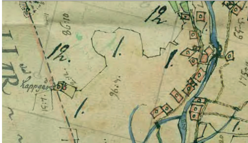
Figure 2. Detail of a map (Sw. avvittringskartan ) from 1803 showing a homestead labelled 'lappgård' in the Lillpite village, Piteå parish. Map from Lantmäteriets historical archive of maps.

areas, has largely been erased by later land use, leaving only marks on the maps.