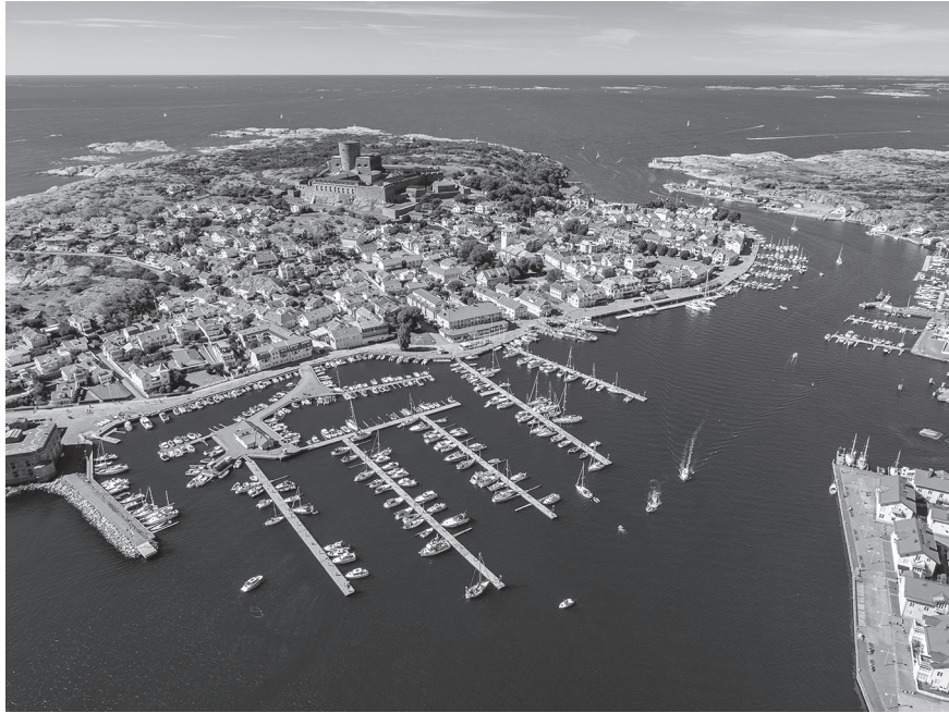
Figure 4. Aerial photograph showing Marstrand and part of Köön. The 17th-century fortress Carlsten sits enthroned over the town and its sheltered natural harbour. The church with its tower is visible among the houses, just above the centre of the photograph.

both refer to Erik Lönnroth (1963, pp. 111–112).