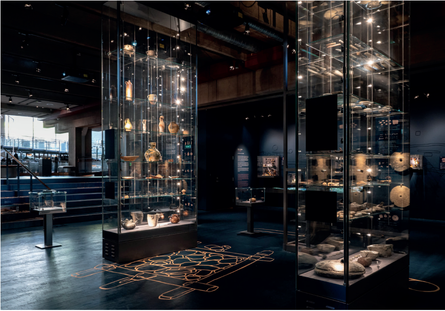
Figure 1. From “ Below Ground. Medieval Finds from Bergen and Western Norway ” (2020).

and role of the artefact within medieval archaeological research primarily from the 1970s and towards the new millennium initiates the presentation and discussion of the two exhibitions. The analysis of the exhibition from 1976 is mainly based on unpublished archive material – like photos, drawings and documents – and reservations are made that not all content and design elements have been captured. The documentation from the 1986 exhibition, on the other hand, also includes first-hand experiences from my own work at Bryggens museum as senior curator. An inclusion of activities that have taken place in or in relation the exhibitions, other public events, as well as temporary exhibitions may