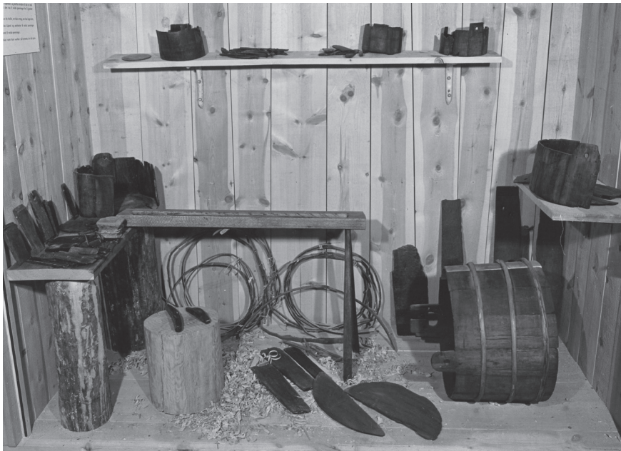
Figure 3. Diaroma: “The turner and the cooper” (workshop).