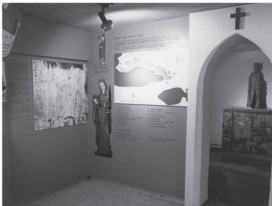
Figure 4. The Church on display.

the exhibition. Artefacts and results from the Bryggen excavation were highlighted, as well as preliminary finds from the ongoing excavation of the small town Borgund outside Ålesund. Neither should the archaeological impact of the extensive excavation site and the impressive “ Big Ship ” be underestimated. In addition, the many colourful thematic stations filled with texts, drawings and other illustrations, as well as the in-depth handbook contributed to an overall impressively comprehensive and informative presentation of the Middle Ages and medieval material culture. Within this context, medieval archaeology and artefacts immediately strikes one as being a