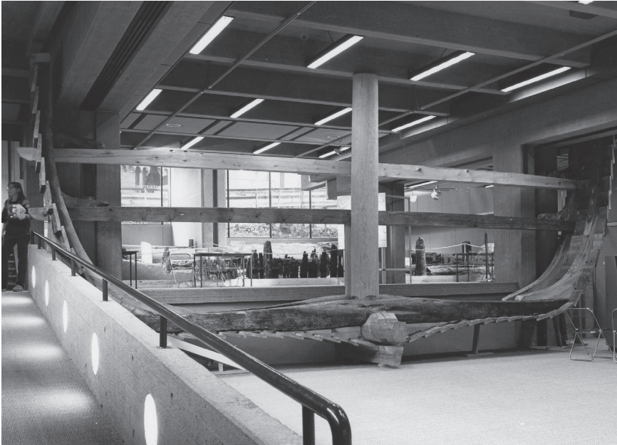
Figure 2. The “Big Ship”. Parts of the “Building Historical Section” is seen in the background, as well as St. Mary’s outside the windows.