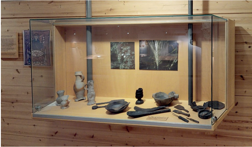
Figure 6. Showcased kitchen utensils.

well as a reconstructed interior, and now inhabited by plaster “mannequins” dressed in medieval clothes. The “tenement” also included built-in showcases with associated archaeological artefacts like toys, kitchen utensils, pottery, gaming pieces, tools, remains of clothes, jewellery and dress accessories (Figure 6). The rearmost part represented a revised and extended edition of “ Øvrestretet ” from 1976 including “workshops” presenting archaeological remains. Next to the “tenement”, there was a relatively open area dedicated to Bergen as a royal, ecclesiastical and cultural centre. This also included a few showcases, the statue of St. Mary and the altar frontal from the 1976 exhibition, and some remains of columns. All parts of the exhibition and their associated showcases were like in 1976 complemented by texts, maps, photos and other illustrations.