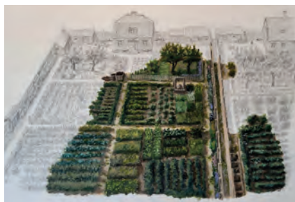
Figure 6. Reconstruction of the garden based on the archaeological results. Jens Heimdahl, The Archaeologists , National Historical Museums.

the Riddaren block on Östermalm, where the terraced garden was dated to the 18th Century (Lindeblad & Hållans Stenholm, in manuscript). Smaller excavations have also been conducted in garden settings, including Piperska Trädgården on Kungsholmen and Björns Trädgård near Medborgarplatsen on Södermalm (Dyhlén-Täckman 2020).