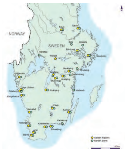
Figure 1. Map of the southern parts of Sweden showing where garden features and plants have been identified through archaeological excavations in medieval and early modern towns. Illustration: The Archaeologists, National Historical Museums.

In this branch of garden archaeology, methods, analyses, and questions have been inspired by Scandinavian landscape and agrarian archaeology, as well as British and American garden archaeology. The objects of research and research questions are constantly broadened, and the latest excavation methods and analyses are used. One example of an important development is the systematic use of archaeobotanical analyses as an integrated part of the excavations (Currie 2005; Lindeblad 2006; Lindeblad & Petersson 2009; Heimdahl 2010; Gleason 2013; Lindeblad & Nordström 2014).