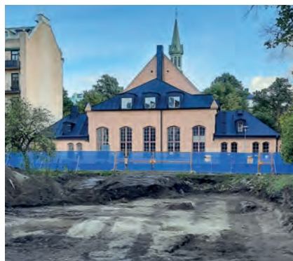
Figure 7. One of the garden quarters, where white sand was laid out, most likely to create a contrast to the darker paths and cultivation beds.

The excavated garden was located in the Rosendal quarter, on the outskirts of 17th-century Stockholm, and was owned by a vicar in the latter half of the century. He was a highly prestigious individual, serving as the priest to the court and queen (Hållans Stenholm & Lindeblad 2023). The garden remnants in Rosendal appear to be unique within a Swedish urban context due to their complexity, variability, and exceptionally diverse and well-preserved archaeobotanical material. Plant residues, as well as finds related to fertilisation and soil improvement, were abundant. These discoveries significantly contributed to understanding the varieties of cultivated plants and