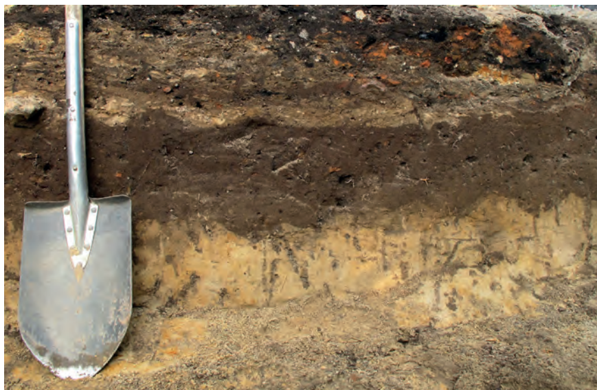
Figure 2. A cross-section of occupational layers containing buried garden soil from an excavation in the town of Norrköping, Östergötland. At the base of the cross-section, within the yellow sand, traces of earthworm activity and root growth are visible. Above this, the brown homogenised buried garden soil can be seen. In the interface between the sand and the subsoil, distinct traces indicate that the garden soil was cultivated using spades.

Lindeblad & Petersson 2009; Lindberg & Lindeblad 2013:79; Lindeblad & Nordström 2014). This method has been developed with the understanding that garden and horticultural remains differ significantly from those of buildings, streets, waste deposits, and conventional occupational layers. Garden soils are typically formed over an extended period and are often largely homogenised due to repeated cultivation. As a result, cultivation layers frequently lack distinct stratigraphy and/or visible structures (figure 2).