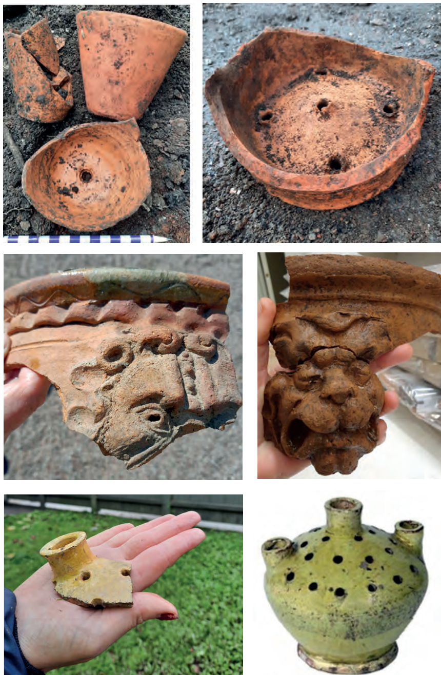
Figure 10a: Examples of planting pots from the Linnean household (left) and planting pots from Frisens park (right). 10b: Two urns from the Linnean household. To the left, a large urn with a Medusa head. To the right, an urn decorated with a lion head. 10c: The sherd of a yellow tulip vase found during the excavation (left), and the exhibited tulip vase in the Linnean museum in Hammarby, just south of Uppsala, to the (right).