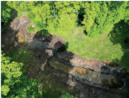
Figure 4. The pond after excavation.

According to the map, the pond had a gently undulating shape and was strategically positioned within the landscape. It was not entirely visible from the south, where the main building was located, but gradually revealed itself upon approach. The surveyor of the map refers to the pond as a "Reservoir." Excavations revealed that the pond had been filled with waste, both from the household and from visitors using the park for recreation. Once emptied, a dry-stone wall lining the interior of the pond became visible, along with a stone foundation for a bridge crossing the pond.