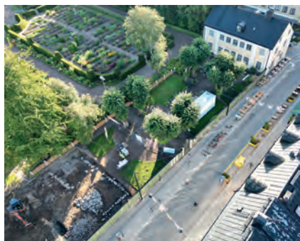
Figure 8. The reconstructed Linnaeus Garden and private home of the Linnean family in Uppsala, with the excavation in the left corner of the picture.

mial classification system for plants and animals). In 1741, Linnaeus was installed as Professor of Medicine and Botany at Uppsala University and subsequently, he and his family moved to the newly renovated Prefect accommodations adjacent to the likewise renovated botanical garden (figure 10). The renovated botanical garden was designed based on Linnaeus's new classification system and organised after the seasons. In the back of the garden, a modern orangery had been built for cultivating and preserving exotic tropical plants.