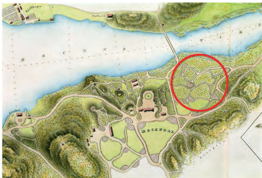
Figure 5a: A historic map from 1834. The red ring highlights the location of the Pleasure ground. Map from the Land Survey.

responded with their placement on the 1834 map (figures 5a and b).