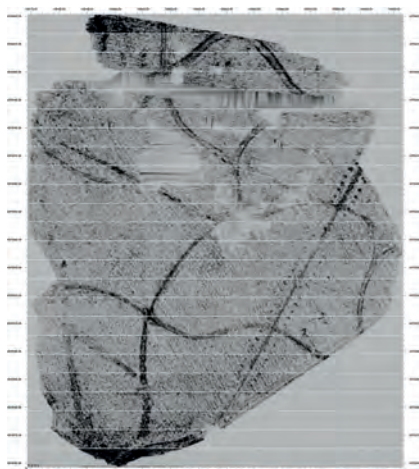
Figure 5b: The result of the ground penetrating survey. Pär Karlsson, Astacus.

Subsequent excavations were guided by the GPR data, with several trenches dug across paths, planting beds, and seating areas. The excavations confirmed that the historic park remains were well preserved just beneath the surface vegetation. The paths uncovered had two distinct widths, both aligning with an old Swedish unit of measurement called "aln" (equivalent to 2 feet or 59.38 centimeters). They measured 1.8 and 2.4 meters, respectively, and were paved with yellow-brown gravel, notably different from the finer, reddish-toned gravel used in the palace courtyard. The archaeobotanical analyses revealed that the paths were not bordered by formal flower beds but rather by natural