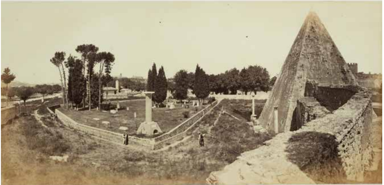
Fig. 2. Robert Macpherson, View of the Pyramid of Gaius Cestius and the Old Cemetery , c. 1864 (McGuigan Collection). Note the walled moat with the Bowles monument centre foreground, and the staircase down to the Pyramid entrance.

would have been the three monuments that are known to have been standing at that date, namely those of Werpup, Macdonald, and Stevens (see Table 1 ). The lack of earlier evidence for stone memorials and de Sade's surprise in 1775 at seeing three of them render it unlikely that others had been erected in the period 1716–1765 and have subsequently been destroyed.