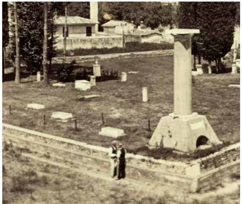
Fig. 3. Detail of Fig. 2 showing alignment of three ledgers and five wooden posts.

A third photograph (also attributed to James Anderson, c. 1860, unpublished, McGuigan Collection) shows another