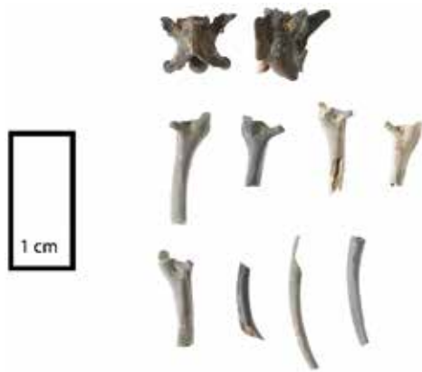
Fig. 2. Burned snake bones.

The microfaunal bone assemblage from the Sanctuary of Poseidon on Kalaureia produced three families of snakes which include several genera and species. More specifically, the Colubridae are represented by Hierophis gemonensis , Malpodon monspessulanus , Elaphe quatuorlineata , Zamenis longissima , and Telescopus fallax . The Viperidae are represented by Vipera ammodytes and the Natricidae by Natrix natrix and Natrix tessellata .