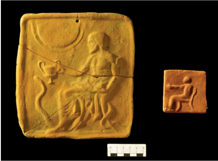
Fig. 6. Terracotta plaques from the sanctuary of Agamemnon and Alexandra/Kassandra at Amyklai. Sparta Museum nos. 6230/1 and 6039/48. After Salapata 2014, web pls. 1.17 and 1.23.