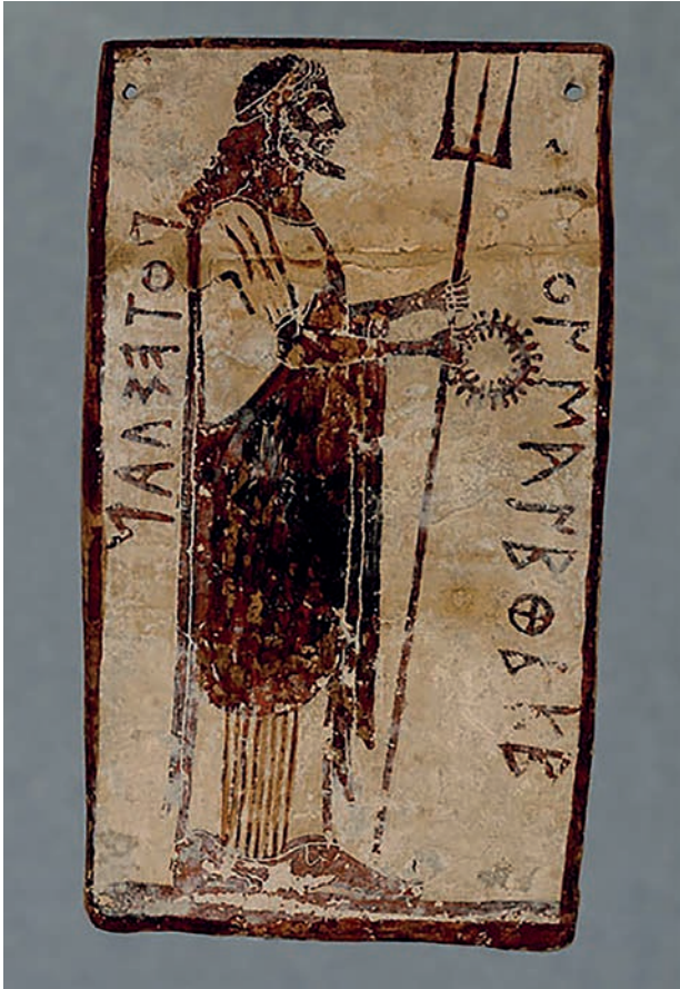
Fig. 2. Painted plaque from Penteskouphia representing Poseidon. Louvre Museum no. MNB 2856. Published with the Museum's permission. http://cartelfr.louvre.fr/cartelfr/visite?srv=obj_view_obj&objet=cartel_6719_8597_g018685j.001.jpg_obj.html&flag=true .