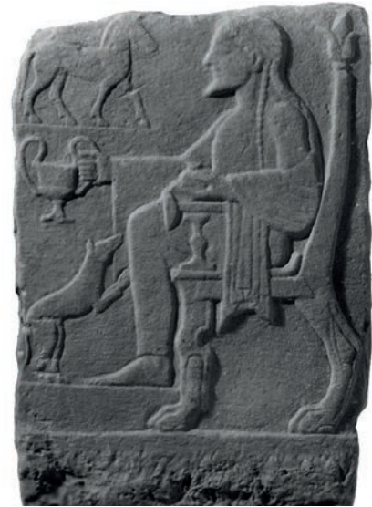
Fig. 7. Stone relief from Chrysapha. Sparta Museum no. 505. After Salapata 2014, web pl. 7.10.

mostly from the perspective of consumption. It has discussed the multiple ways people might have valued modest offerings and how these were related to their lives. Even though small inexpensive offerings were affordable by poorer people, their dedicators likely came from all walks of life. Various factors may have influenced the choice of modest objects as dedications. People were sometimes driven by personal concerns or the circumstances of their visit, and by the occasion of the offering. They could have been influenced by the nature and character of the recipient deity or type of sanctuary, by specific rituals practised in the sanctuary, or by regional dedicatory practices and preexisting offerings. The selection of offerings might have been limited by practical considerations that included not just cost but also portability or availability of types at local workshops and sanctuaries.