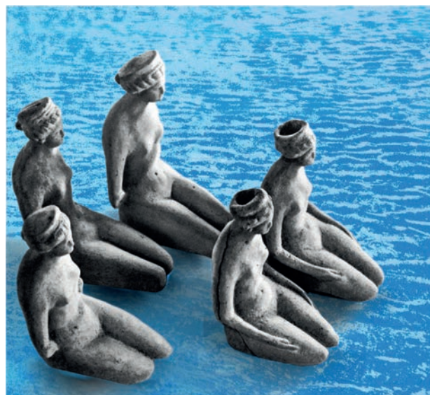
Fig. 5. Reconstruction of positioning of terracotta figurines from Grotta Caruso. Based on Costabile 1991, 116, fig. 191.

During the ritual activity at the cave sanctuary, it is assumed that nubile young women (individually or collectively) went down the stairs to the water, sat on the submerged rock and poured water over themselves. Prenuptial ritual bathing for purification and fecundatory purposes was common in