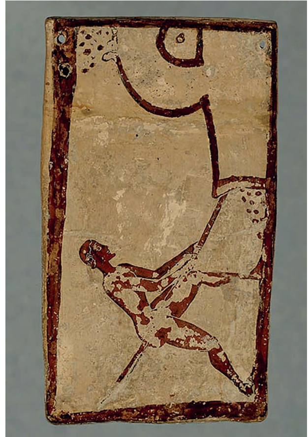
Fig. 3. Reverse side of the plaque depicted in Fig. 2: firing a potter's kiln. Louvre Museum no. MNB 2856. Published with the Museum's permission. http://cartelfr.louvre.fr/cartelfr/visite?srv=obj_view_obj&objet=cartel_6719_29030_g018685j.002.jpg_obj.html&flag=false .

Sometimes, local rituals may have determined what objects were dedicated in a sanctuary. Cheap cultic vessels specifically made for a particular sanctuary, like the Brauron krateriskoi , miniature louteria at Agrigento, 69 and kernoi or likna at Demeter sanctuaries, 70 convey specific cultic messages and imply large-scale participation. Such specialized types could have been produced on site or nearby but there is little evidence for workshops associated with or near sanctuaries. 71 Since offerings would generally not have been produced exclusively for the needs of specific cults, it is more likely that certain