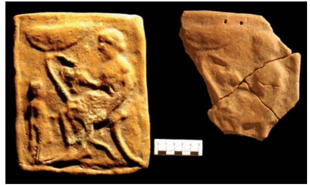
Fig. 1. Terracotta plaques from the sanctuary of Agamemnon and Alexandra/Kassandra at Amyklai; second generation replicas. Sparta Museum nos. 6229/1 and 6229/5. After Salapata 2014, web pl. 1.278

It is also likely that the type of some offerings was determined by the occasion, depending on whether the favour asked was small or big. When life was good and without major worries, simple rites would be enough to keep open the lines of communication with the divine world. 60 Thus, “routine” piety, such as a casual visit to a sanctuary or presentation of a portion of earnings, like first fruits, 61 would have called for frequent simple tokens of respect offered by both poor and rich individuals. 62 For example, Ioanna Patera suggested that within the Sanctuary of Demeter on Acrocorinth, simple offerings were used as a type of entry fee from one area to another. 63 Conversely, moments of crisis or special occasions may have called for richer offerings from those who could afford them. Thus, wealthier people could have dedicated both expensive and token offerings depending on the occasion.