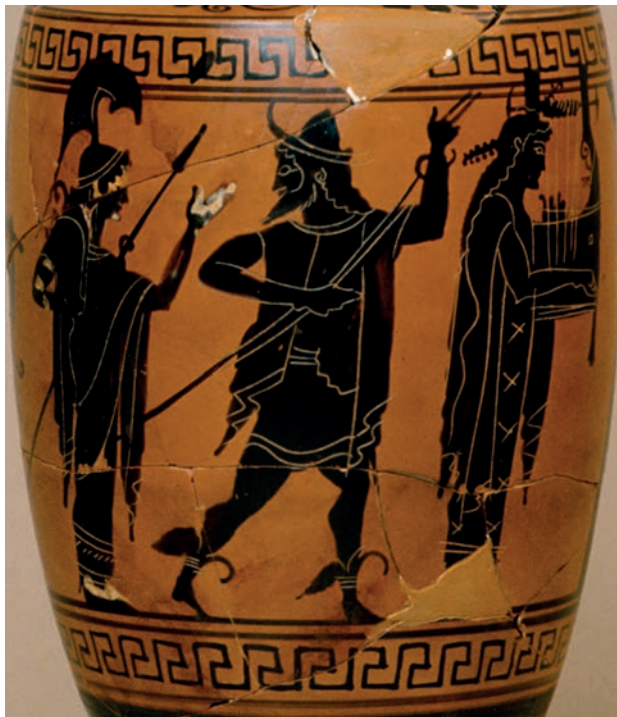
Fig. 5. The introduction of Herakles into Olympus. In front of Herakles (not seen in the image) are Athena, Hermes and Apollo. Hermes makes the benedictio Latina gesture with his left hand. Lekythos , c. 510–500 BC. Courtesy, the American School of Classical Studies at Athens: Agora Excavations, inv. no. P 24104.

fingers are broken off. 41 Furthermore, none of the hands were decorated with any attached symbols. However, that feature may be later, as the earliest dated Sabazios hand from Dangstetten (see above) does not carry any other symbol than the snake. Of interest is that these hands from Priene may have filled a similar function as the Sabazios hands, as at least one of them has a hole on the lower arm that was probably used to attach it to a wooden stick. 42 Further, as the fragmentary hands were all found in a shrine some form of cultic connection appears to be the most plausible interpretation.