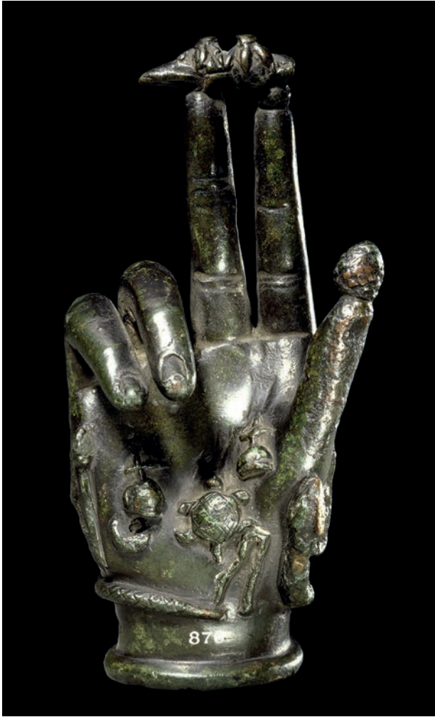
Fig. 1. Bronze hand found at Tournai in Belgium, close to the Belgian-French border, now in the British Museum, inv. no. 1895, 0621.4. Height c. 15 cm.