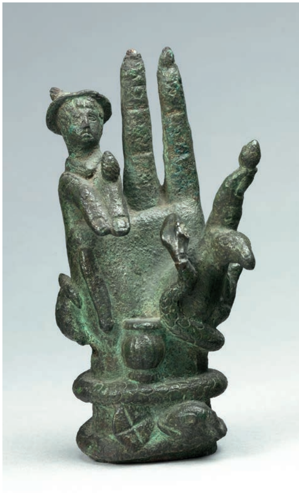
Fig. 7. Bronze hand of Sabazios with bust of Hermes. Musée du Louvre, inv. no. Br. 836. Height 12.2 cm, 3rd century AD.

significant that there is a link between the gesture and Hermes both in the earlier Greek vase paintings and on the Sabazios hands. It is hardly a coincidence in my opinion, and I would like to suggest that Hermes was closely associated with Sabazios because of his role as Psychopompos . At least by the Hellenistic period, the gesture seems to have signified speech, and was a suitable gesture to signal the instructions or secrets learned when