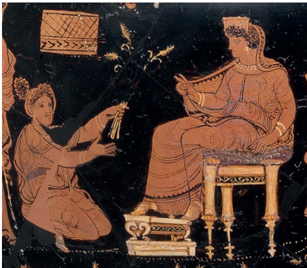
Fig. 10. Demeter makes the benedictio Latina gesture with her right hand while seated on a throne, as Metaneira kneels in front of her. Apulian hydria, c. 360/350 BC.