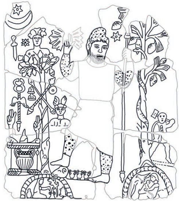
Fig. 2. Bronze plaque from Emporiae, now in Girona Museum. Drawing by the author after Lane 1985, fig. 85.

The main material evidence of the cult are the sculpted hands in bronze, usually at life size or smaller, of which there are around 80 examples, in addition to 14 figurines or busts that were probably once attached to hands. 15 As well as the hands,