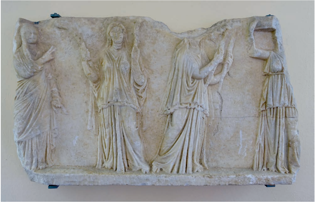
Fig. 9. Two parts of a marble relief likely from Halicarnassos are preserved in two different museums. This is the part in the Martin von Wagner Museum in Würzburg, inv. no. H 4794. The woman on the far left makes the benedictio Latina gesture with her right hand.