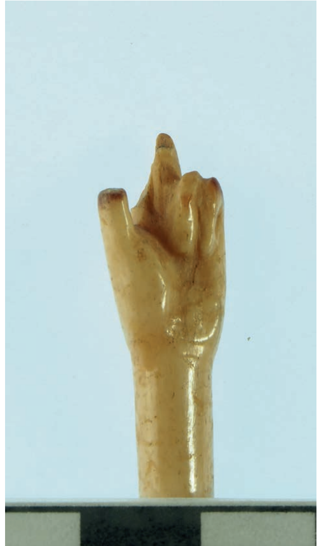
Fig. 4. The hand on top of the bone pin from Gordion. The thumb, index and middle fingers are broken off, but were held straight, while the ring and little fingers were folded.

The hand gesture is otherwise missing in material associated with Sabazios from Western Asia Minor, such as Lydia, from where we have some of the earliest material related to Sabazios. However, several terracotta fragments of in particular right hands were recently found in a deposit at a Hellenistic rock shrine at Priene. 39 These hands are slightly larger than life size and the fingers appear to have been held in various positions. The benedictio Latina gesture cannot be confirmed for any of these hands, but the fingers of several hands were broken off. The shrine has on basis of the finds been identified as one of the Mother Goddess. 40 Whether these hands were connected with Sabazios we do not know, but some of them were definitely not held in the benedictio Latina gesture and there is only one fragmentary hand that is a possible candidate for the Sabazios gesture, but unfortunately both the ring and little