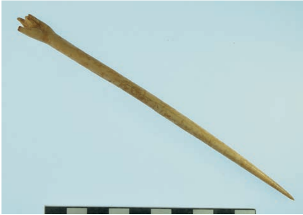
Fig. 3. Bone pin (inv. no. 2085-BI-170) from the city mound of Gordion. Preserved length 16.4 cm.

ture. 36 It is uncertain whether these are indeed hair pins; we may consider other functions, such as styli , drawing or writing implements used on wooden tablets covered with wax. The hand on top may be seen as a more appropriate decoration for a stylos rather than a hair pin.