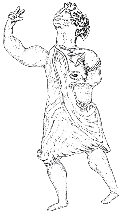
Fig. 8. Detail of krater from the Mithraeum in Mainz. The mystagogue makes the benedictio Latina gesture with his right hand. Exhibited as loan in the Archäologischen Museum Frankfurt am Main. Preserved height of the vessel is 39 cm. Drawing by the author after published photograph, Huld-Zetsche 2008, pl. 65, figure 3, scale 1:1.

being initiated. The bronze hands may therefore be associated with the Sabazian mysteries, and they have also been interpreted as evidence of the mysteries, although the gesture itself was described as one of blessing. 57 I would rather like to suggest that the gesture was adopted as a symbol of the initiation into the mysteries of Sabazios, an event that involved a mystagogue, who acted as a teacher or instructor. The mystagogue guided the mystos through the initiation process, i.e. the mystagogue acted in a position similar to that of Hermes, and especially in his role as Psychopompos . That Hermes also played this role in the Sabazios cult is explicitly demonstrated in wall paintings in a Roman tomb, where Hermes/Mercury is seen leading the deceased wife of a Sabazios priest into the Underworld. 58 Let us now discuss a few examples where the gesture may be associated with other mystery cults as well.