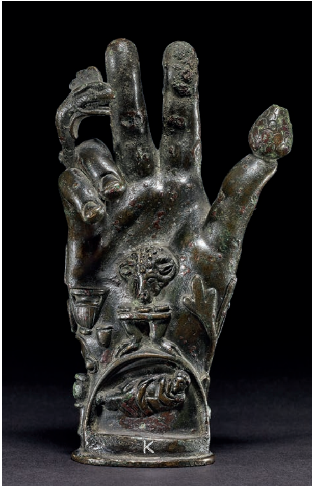
Fig. 11. The palm side of a bronze hand of Sabazios. 1st century AD. British Museum inv. no. 1824,0441.1. Length 15.24 cm.