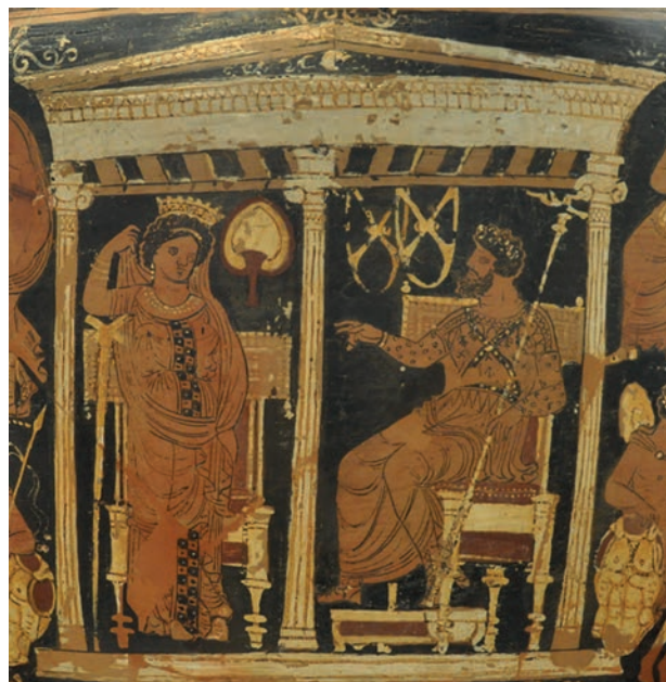
Fig. 6. Persephone and Hades in the Underworld. Hades makes the benedictio Latina gesture with his right hand. Apulian volute krater, c. 320 BC. Courtesy of The Spurlock Museum, University of Illinois at Urbana-Champaign, inv. no. 82.6.1.

The gesture is also known from later profane contexts, where it indicated speech, especially among actors. 53 The specific gesture is mentioned in two or three written sources. Quintilian ( Inst. 11.3.92–104, c. AD 95) listed various gestures performed by a Roman orator, and some scholars are of the opinion that the benedictio Latina is not among those, while Richter argues that four variations of the gesture are listed. 54 All the gestures listed by Quintilian are speech gestures and he did not elaborate much regarding the use of them, so even if this gesture is indeed described it would only confirm