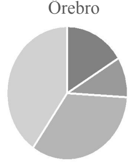
Figure 2: Sources of estimated cost reduction