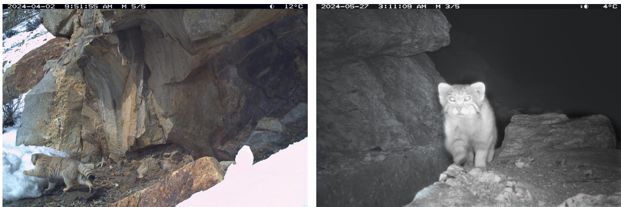
Figure 2. Pallas's cat captured in Hangrang valley, Upper Kinnaur.

3900–4100 meters above mean sea level. The Pallas's cat was photographed once at each of the three sites, with a total of 19 images, during the early morning hours, specifically between