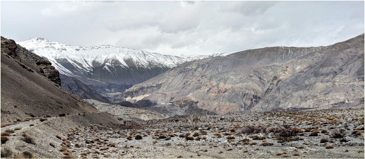
Figure 3. The trans-Himalayan landscape from Hangrang valley in Kinnaur.

mountains with precipitous watersheds flowing into the Sutlej (Rahimzadeh, 2016). The habitat in the surrounding area where we recorded the Pallas's cat was covered with medium-large sized rocky boulders and cliffs, interspersed with patches of meadows (Figure 4). One of the