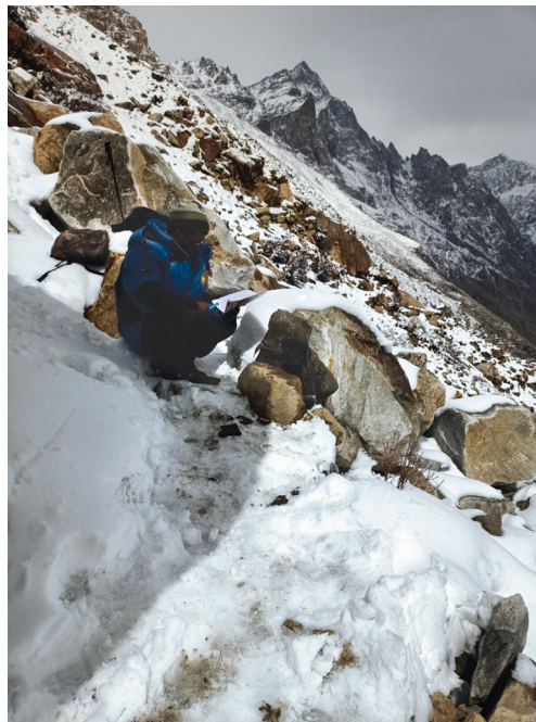
Figure 4. Trans-Himalayan region of Upper Kinnaur where camera traps were placed.